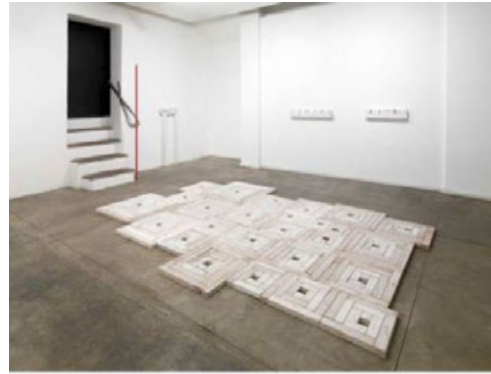
Installazione di Paolo Icaro alla galleria G7